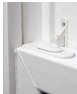
WOCD device is located on the outer sides of the top sash.