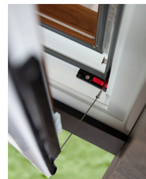
WOCD device is located on the interior of the sash and jamb.

If at any point you notice that your WOCD device is not operating correctly or is no longer effective, please contact your certified dealer to order replacement parts.